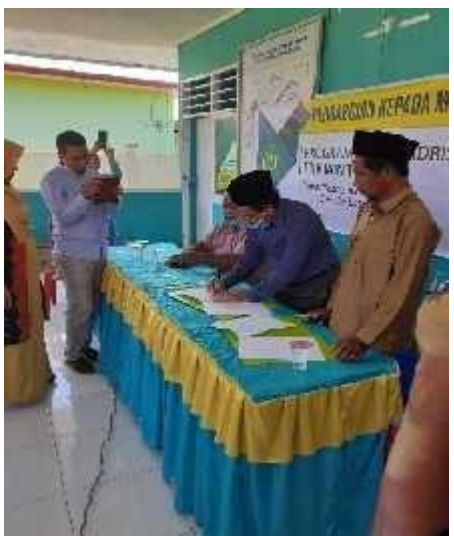
Figure 2. Mou signing by PkM Team and Balbar Headmaster after signined the MoU

The first step in ABCD-based PkM activities is to coordinate and establish Balbar Village as a target village through the signing of the MoU by the Community Service Team and the Headman of Balbar.