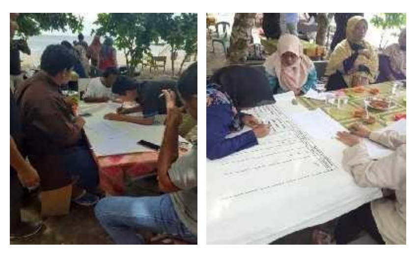
Figure 3. Asset Collection through FGD with Balbar Community

The service team conducts asset collection through FGD.